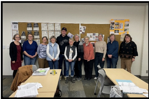
Group photo at the last session at PCC Rock Creek on November 15 th

Last month, PLC completed the final workshop for our 2nd cohort of Foundational Literacy tutors. Six new tutors completed the course and one person from the first cohort repeated the series. We also had a PCC ESOL instructor in each workshop, which gave the tutors terrific insights into the broader community.