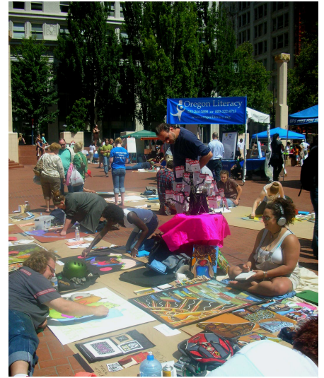
Many artists and onlookers enjoyed the Chalk It Up Celebration earlier this summer.